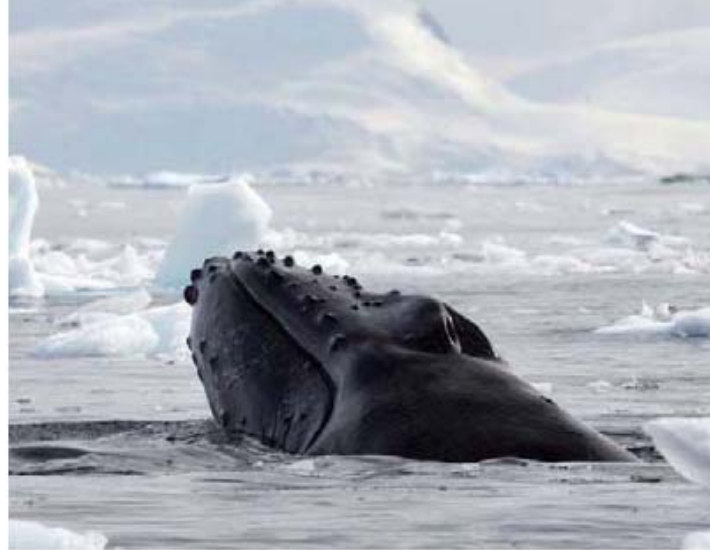
A humpback whale in icy Antarctic waters