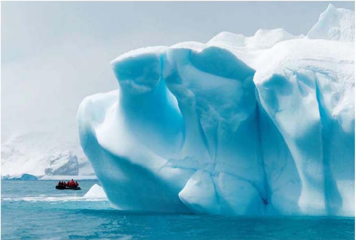
Approaching a sculpted iceberg in the Antarctic waters

14 Days | Departs Tuesday, returns Monday