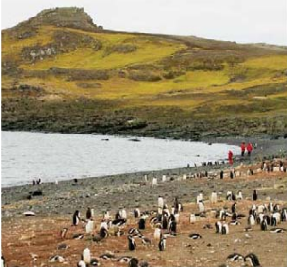
Exploring the wildlife of an Antarctic coastline