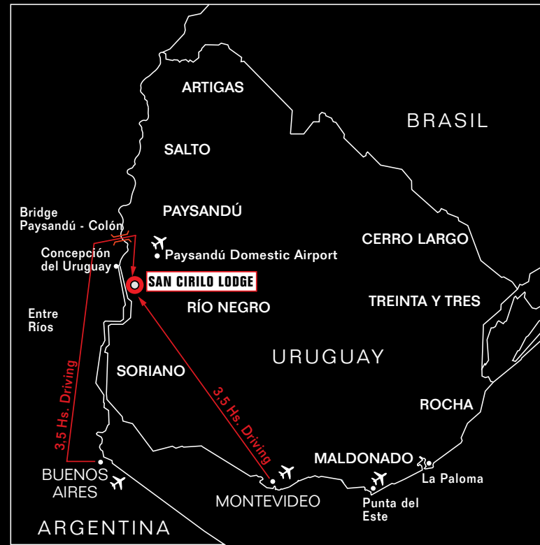
RIO NEGRO, URUGUAY.